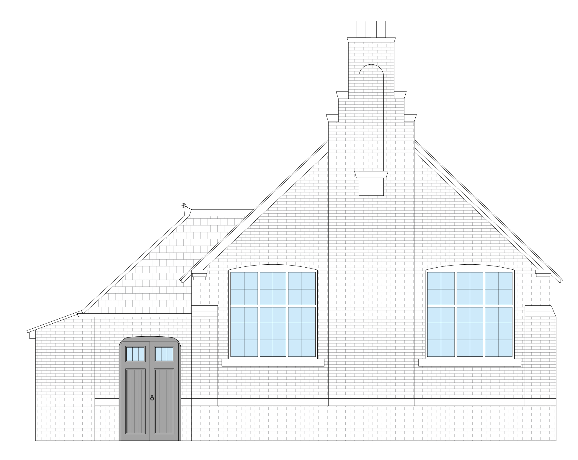
EXISTING SOUTHERN ELEVATION SCALE 1:50